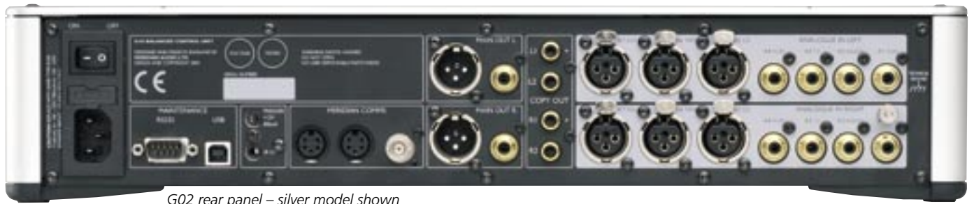
G02 rear panel – silver model shown