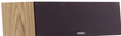
twenty·C in Oak